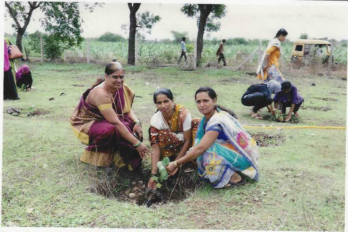
६ जुलै २०१७ कानडवाडी येथे वृक्षारोपण